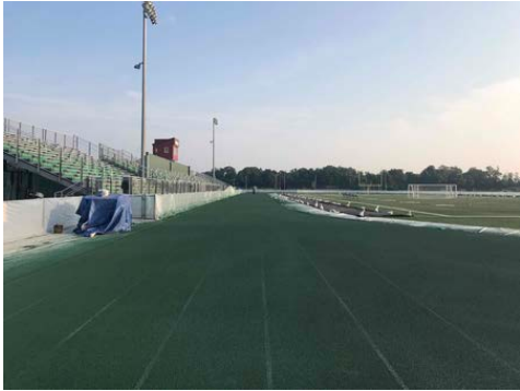
HS Track Recoating