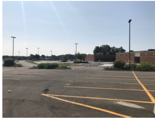
HS Parking Lot Paving