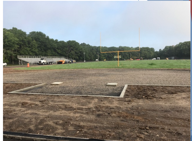
JHS Track Reconstruction