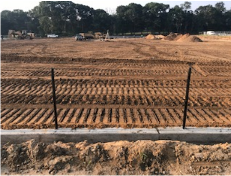
HS Multipurpose Field