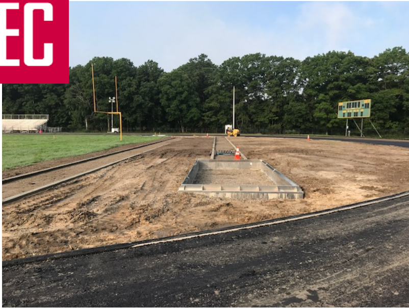
JHS Track Replacement