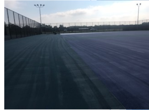
HS Tennis Courts