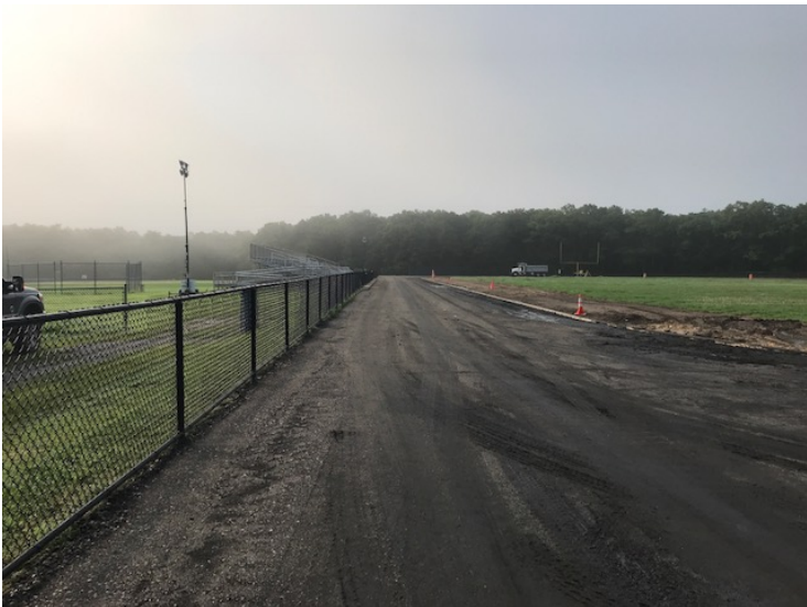
JHS Track Paving