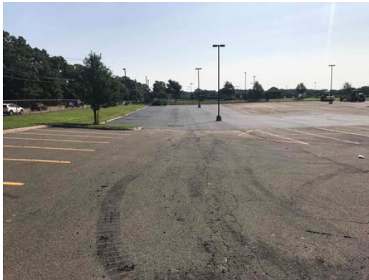
HS Parking Lot Paving