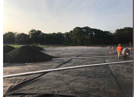
Multipurpose Field Under Turf Drainage