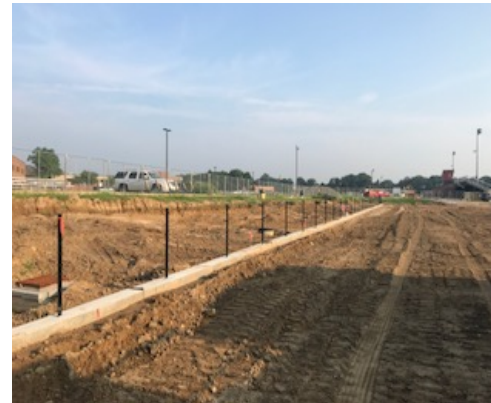
Multipurpose Field Curb and Fence