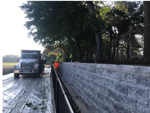
Multipurpose Field Retaining Wall And Fence