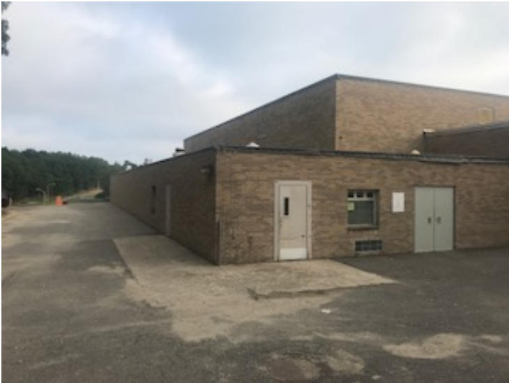
JHS Roof Replacement