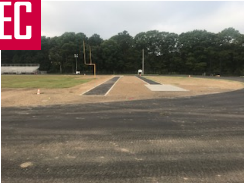
JHS Track Paving