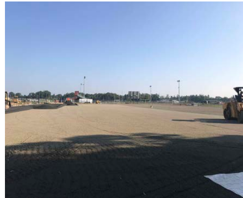
Multipurpose Final Stone Layer