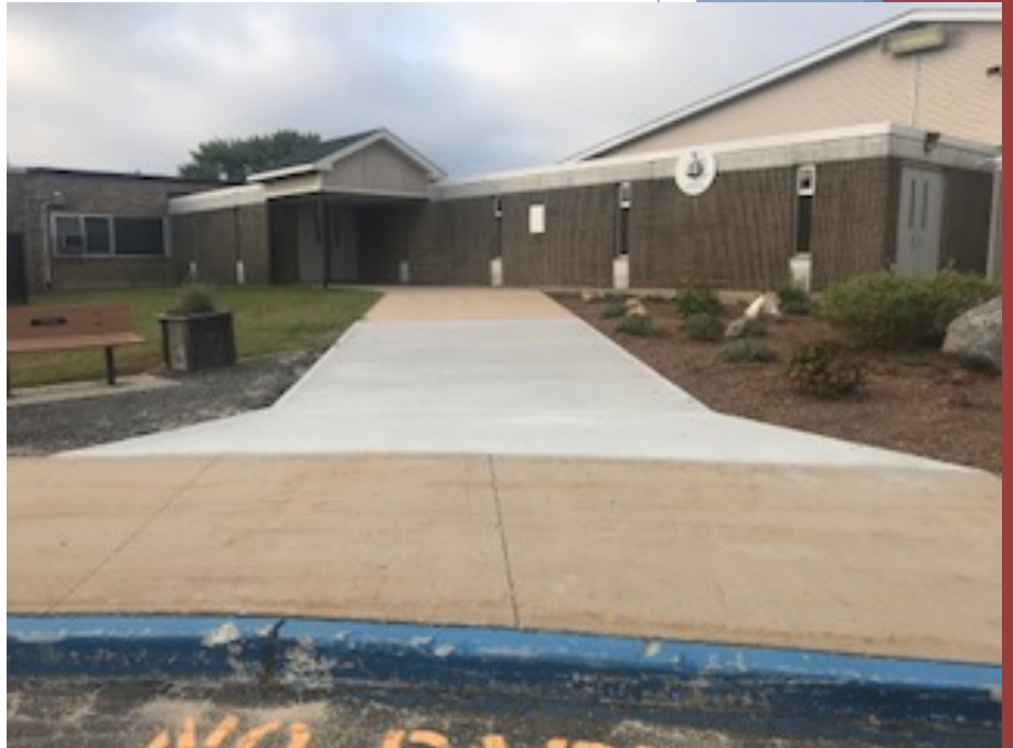
JHS Flat Work