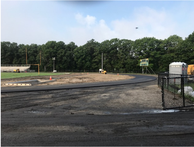
JHS Track Paving