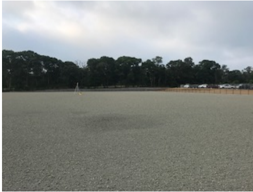
HS Multipurpose Field Ready for New Turf