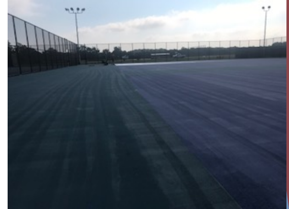
HS Tennis Court