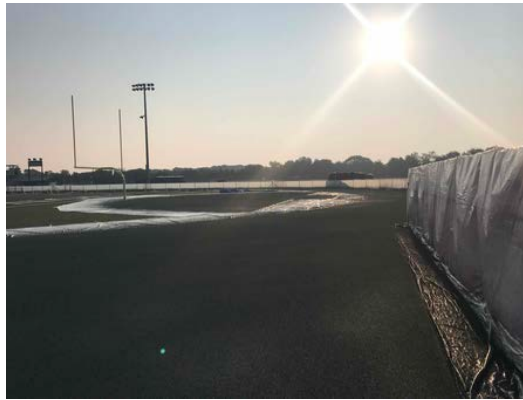
HS Track Recoating